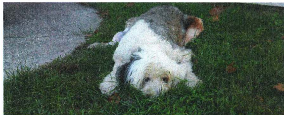
Mopsey lies in the grass

AMC — SINCE 1910 — ANIMAL MEDICAL CENTER