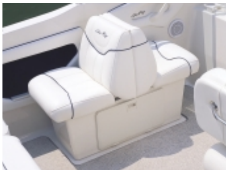
New for model year 2000 are optional back-to-back seats on the portside.